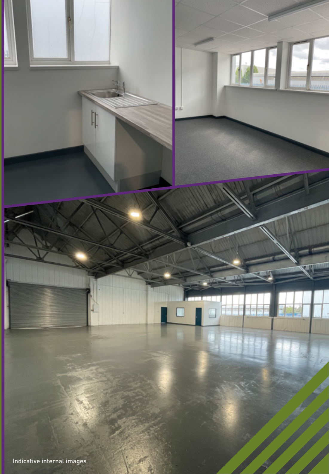
Indicative internal images