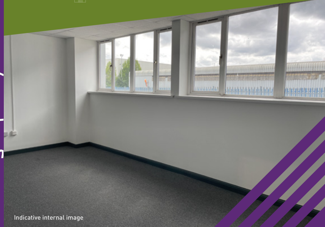
Indicative internal image