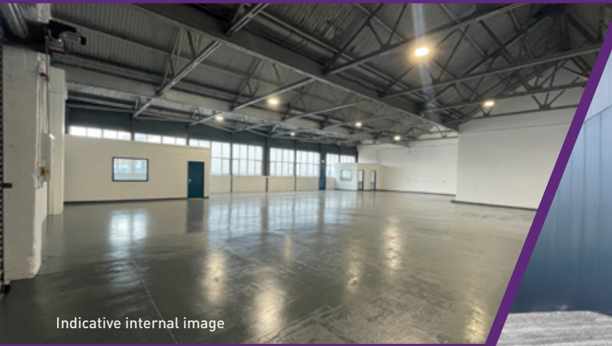
Indicative internal image

Flexible Terms with Immediate Occupation