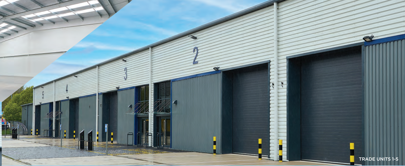
TRADE UNITS 1-5