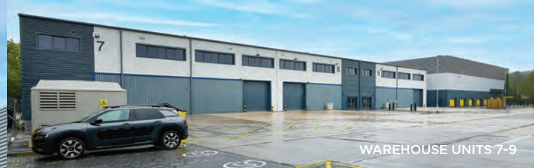
WAREHOUSE UNITS 7-9