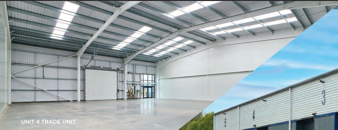
UNIT 4 TRADE UNIT