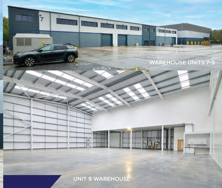
UNIT 9 WAREHOUSE